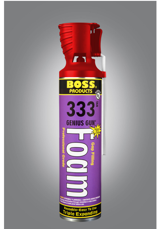
Manufactured under Patent No. 10106309

*Information on this data sheet is subject to change without notice and should not be used for writing specifications. For additional information on specific applications, contact Soudal.